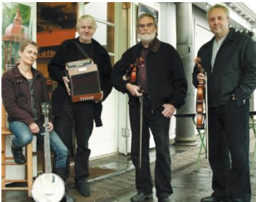
Buffalo in the Castle

The FSU Appalachian Festival is supported in part with funding from WFWM, the event’s official media sponsor, the Maryland Traditions Program of the Maryland State Arts Council, the FSU Foundation, Culture Ireland, the Allegany Arts Council, the Sierra Student Coalition, Learning Green Living Green and the National Endowment for the Arts.