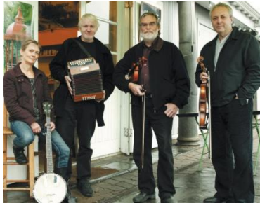
Buffalo in the Castle

Facebook or email krogerstthomas@frostburg.edu .