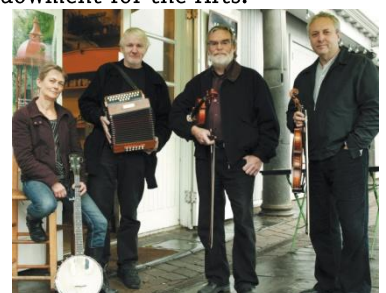
Buffalo in the Castle

The FSU Appalachian Festival is supported in part with funding from WFWM, the event's official media sponsor, the Maryland Traditions Program of the Maryland State Arts Council, the FSU Foundation, Culture Ireland, the Allegany Arts Council, the Sierra Student Coalition, Learning Green Living Green and the National Endowment for the Arts.