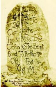
The Braddock Stone, a 1-ton, 5-foot-high engraved rock used as a highway sign during the 18th century, is moving to the Frostburg Museum.