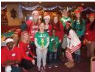
Santa’s elves pose with Storybook Holiday participants.

Storybook Holiday will be held on Saturday, Dec. 3 , in downtown Frostburg. There are multiple time slots for each job at Storybook Holiday; the volunteer slots are listed in chronological order. You will need to be at your job 30 minutes before the job starts to sign in. Include your name and email address so you can be contacted with information before the event, and text @sbh2016 to 81010 to receive text updates the day of the event. Your personal number will not be used for anything else, and it is not shared. When signing up, be sure your jobs do not overlap times.