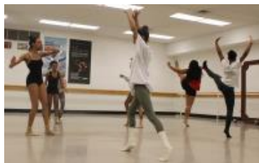
Members of the FSU Dance Company rehearse for their upcoming production.

FSU's Department of Theatre and Dance will debut a unique dance concert on Thursday, Nov. 10, through Saturday, Nov. 12 , in the F. Perry Smith Studio Theatre of the Performing Arts Center. Audience members will get two for the price of one as the FSU Dance Company presents two concerts in one evening. Performances begin at 7:30 p.m. on Nov. 10 and 11 , with a matinee suited for a lunch before, or dinner after, on Nov. 12 at 3 p.m.