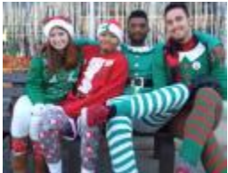
A few of Santa’s elves posed for a photo at a previous Storybook Holiday.

This year, Storybook Holiday will be held on Saturday, Dec. 3 , in downtown Frostburg. To volunteer, visit the Children’s Literature Centre web page at www.frostburg.edu/clc or the Facebook Page at www.facebook.com/clcfstu . For info, email clc@frostburg.edu or call 301-687-3133.