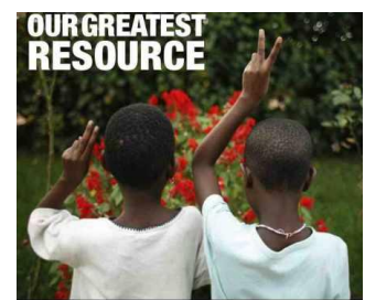
Pictured: Two survivors under the age of 9.