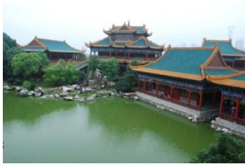
The Changsha locale

Thanks to the efforts of professors at FSU, the Center for International Education and FSU's partners overseas, the University's College of Business is expanding study abroad opportunities for students. Three new study abroad programs offered through FSU's College of Business will make it possible for students to experience and study the vibrant culture of China.