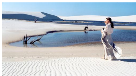
A scene from "Casa de Areia"

The Office of Student Activities and Greek Life and the University Programming Council present their third annual Bridges to the World International Film Festival. The following films will be shown on Tuesdays at 7 p.m. in Lane 111. The event is free and open to the public. All movies will have English subtitles.