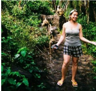
A student and primate friends in Botswana

The Center for International Education offers various ways for FSU students to see the world. In some cases, students can pay FSU tuition, room and board and study for a semester or a year in Ireland, England, Spain, France, China, Italy, Australia, Peru, Botswana or in many other countries. FSU also offers summer study abroad programs. Financial aid, student loans and scholarships are available.