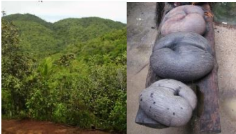
Vallée de Mai Nature Reserve on the island of Praslin, Seychelles, and coco de mer nuts

The Frostburg Science Discovery Center is displaying a coco de mer nut, on loan from an FSU student. The coco de mer, a palm native to the islands of Praslin and Curieuse in the Seychelles, has the largest seeds (double-nut seed) of any plant in the world.