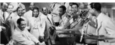
Duke Ellington with his orchestra